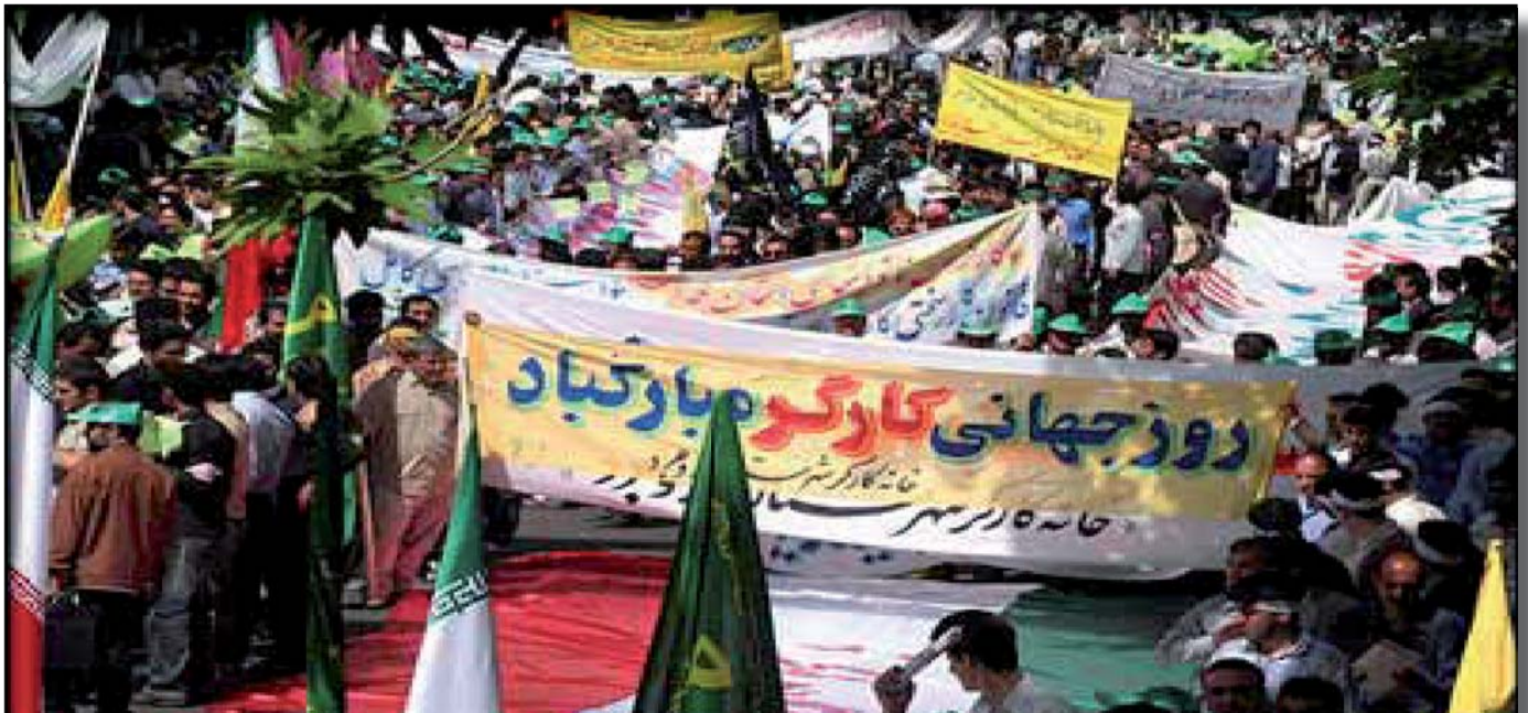
Mayday demonstrations in Tehran